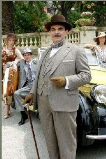
← Hercule Poirot