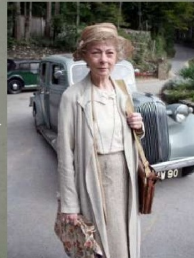
Miss Jane Marple →