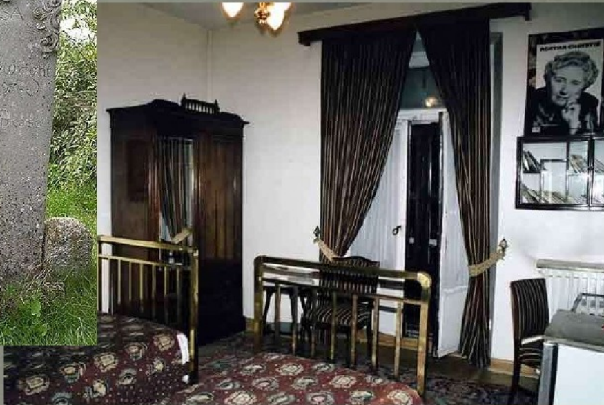
picture of the room at the Hotel Pera Palace, where she wrote Murder on the Orient Express