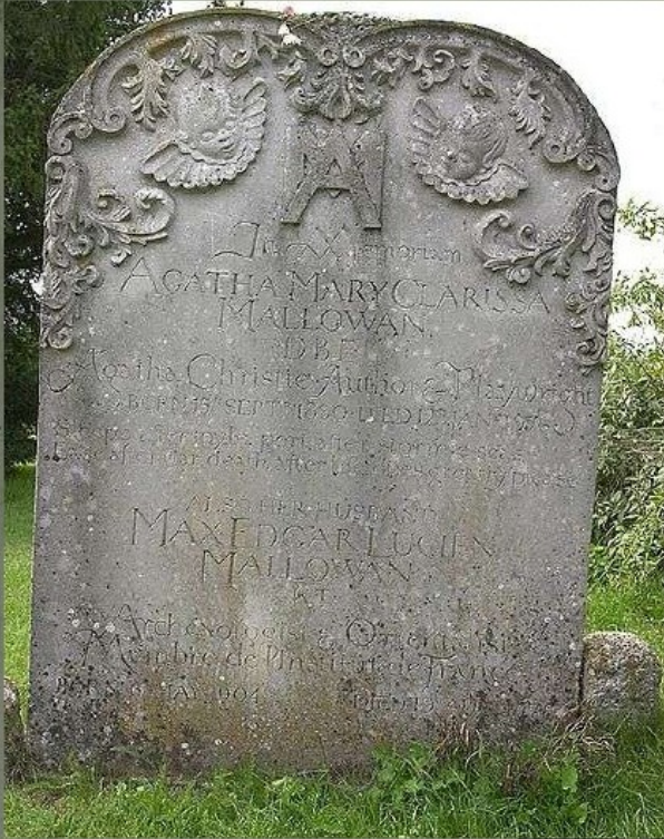
Agatha Christie's gravestone in Cholsey